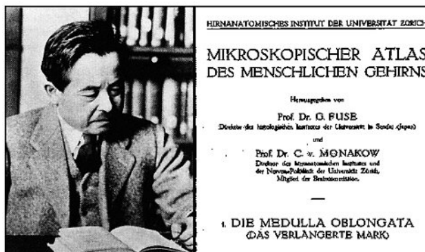
Figure 4 Oblongata Atlas.